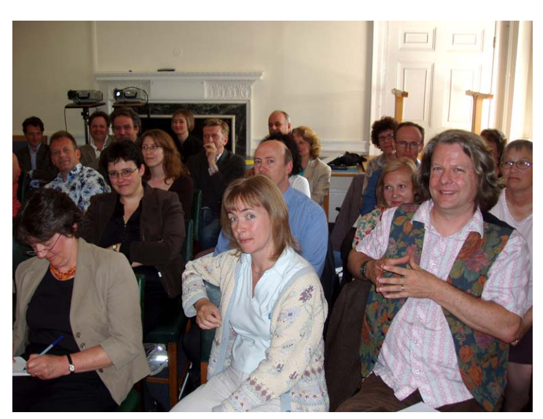
Happy attendees at a Digital Picture seminar

Each seminar resulted in a unique discussion with different flavours or emphasis though, overall, the same issues came up time and time again and, while details differed, the conclusions drawn from each seminar were remarkably similar across the UK. For instance, in Bristol, at the AAH Conference, the discussion very much revolved around the provenance of digital images, as might be expected from an event so focused on the art history perspective; in Glasgow, however, issues of image quality and copyright came up, issues that are perhaps of more significance in an Art School environment.