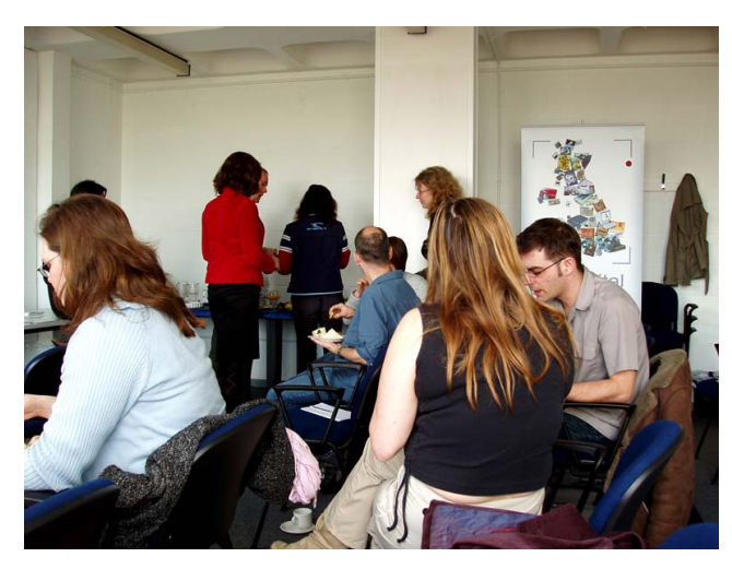
The conversation continues over lunch

Other successful internet tools like Napster and Flickr were also discussed, the principles of which could be applied to education systems whereby images could potentially be shared between institutions without the need for them to be visible in a national online collection. While the idea was problematic in a number of areas, it was thought that it could act as a mechanism that could potentially circumvent some copyright issues.