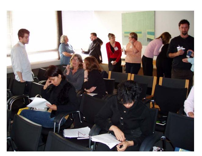
A well earned break at a Digital Picture seminar

work: there were cries that 'Possession kills creativity!', and fears of a 'Stalinist takeover'! While on the face of it, thousands of images could easily be made available, there was scepticism over how many of them would be pertinent in an educational context, particularly in regard to the way that a corpus would be identified, and by whom. There was also concern over how such a service could meet subject-specific. academically-focused search, retrieval and research requirements. The needs of users, it was felt, could not be guessed by those 'at the top', and while the benefits of centralised and managed control were appreciated, the fear of losing control and resources to an 'external body' was strongly voiced.