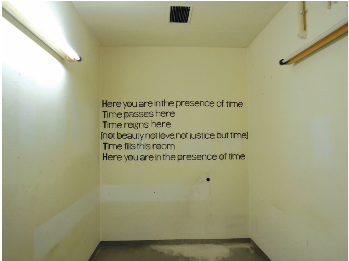
Figure 4. de Melo, M (2012) Time Sculpture , Chemnitz. Photo by the author: Amsterdam.

I am inclined to suggest that time as art practice is an idea mostly propagated by art institutions; both through the use of time as material itself, and through gathered materials which directly connect to the idea of occupying time.