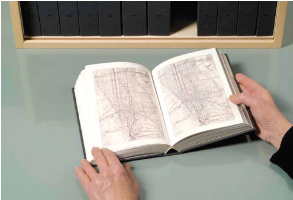
Figure 2. Kawara, O (1968-79) I Went [daily trips traced on photocopied map, 4740 pages, 12 volumes] At: http://www.micheledidier.com/media/catalog/customfield/on_kawara__i_went.pdf (Accessed on 16.07.15).

In parallel with Kawara's practice I have travelled widely, and also worked with postcards that were made from gathered tickets and packaging material from places that I visited and then sent to friends around the world. I have cultivated this practice since 2003, however I was unaware of its relevance and implications until quite recently. These postcards have triggered the production of a large number of small-scale works that I have already mentioned. These works, which ultimately deal with consciousness, are conceptually related with Kawara's practice. The major difference between our processes is that Kawara uses precise measures with regularity, whereas I use aleatory and suggestive measures as I am interested in irregularity and non-linearity. Like Kawara, I am also interested in movement and change as they can also function as 'our awareness of time, an awareness shaped by a sequence of events determined either by ourselves or by external circumstances' (Wilmes, 2000, p.13).