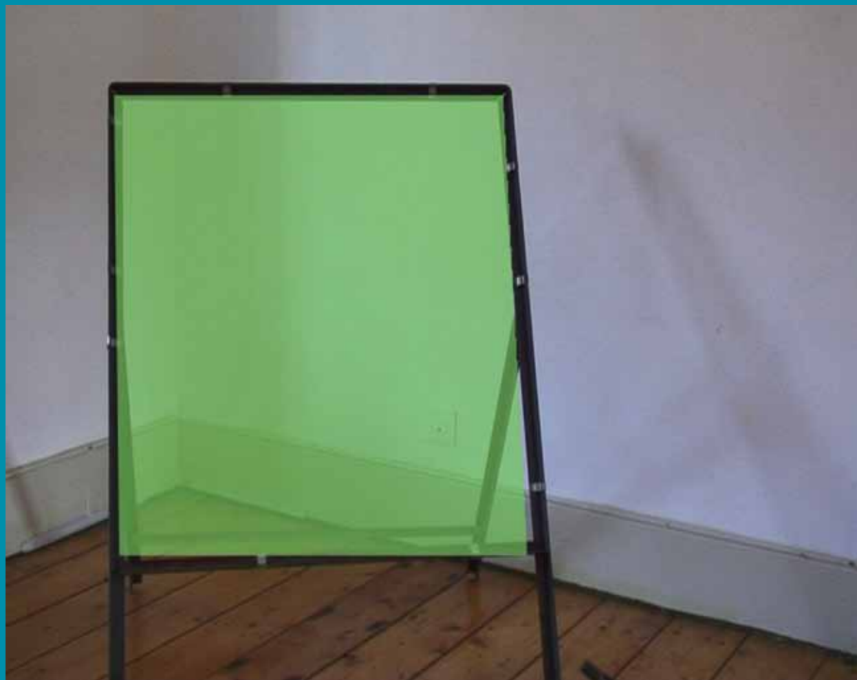
The Jazz Singer Video

Listening is not a neutral activity, but rather involves a strategy and regime. By listening to voices critically we must engage with a combination of ideas from psychoanalysis, phenomenology and cultural critiques, that do not invalidate each other, as the voice cannot be pinned onto any one theory. The voice cannot speak about itself, however, the aim of the research is to describe its' functions, and open up lines of enquiry for the voice as a form, object and material, to discover what gives rise to voice in Fine Art practice. We read and listen to voices as much as to what they say. Voices reveal information about the subject speaking that is direct, affective and outside of language.