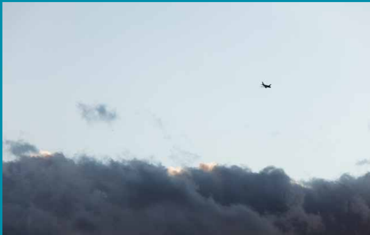
From the series Ithaca Photography Dimensions variable