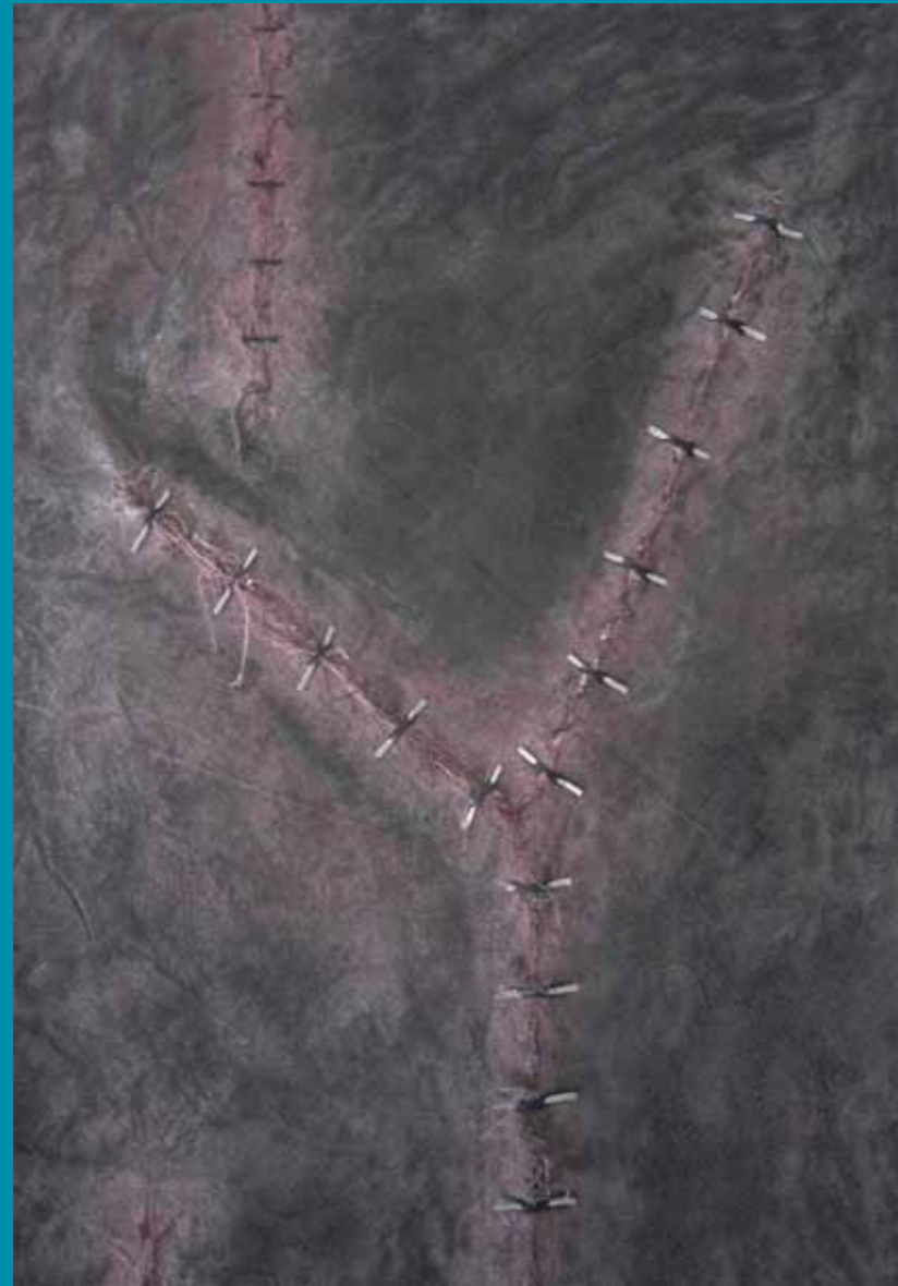
Healing series Calico, thread, lead Three pieces each 1.93 x 0.4 m