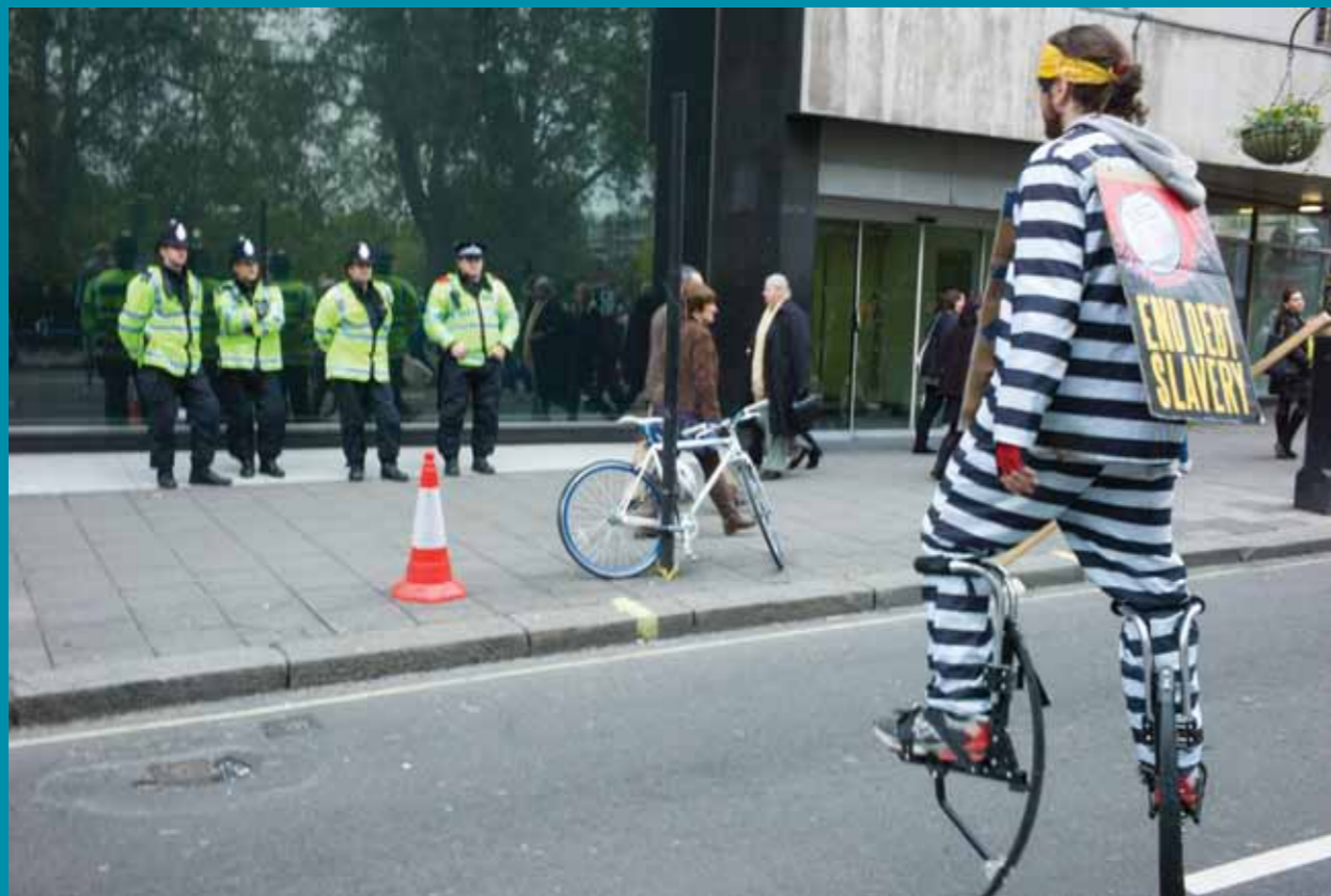
Living with a Neo-liberal response Pigment ink on archival paper 420 x 594 x 30 mm