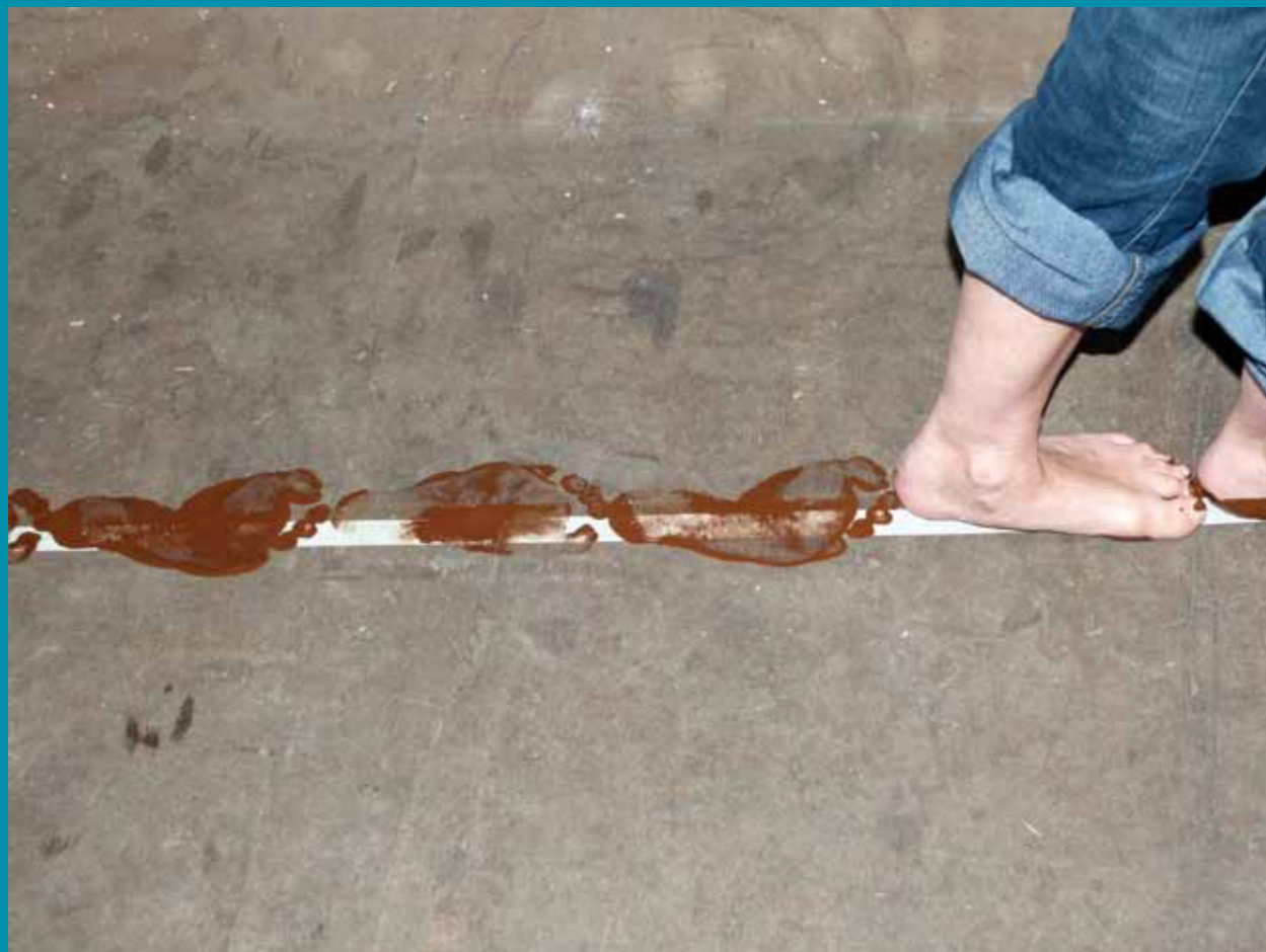
100 feet 16 mm film and dirt and performance Dimensions variable

Vicky's art is located between the 'wayward' work of women using animation creatively to interrogate subjectivity and an experimental materialist approach in which autonomous integrated reflexive practice and self skilling are the conditions through which the female voice is made possible.