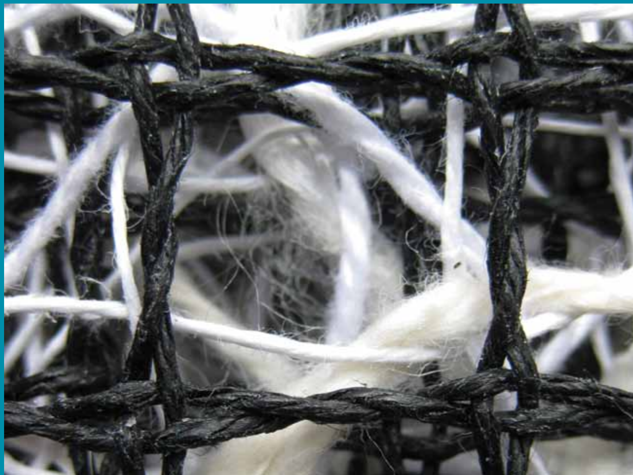
Mediation (detail) Mixed threads 200 x 20 cm (variable)

Gail has exhibited widely in Europe and her work is held in both private and museum collections. Further examples can be found at: www.ghostreestudio.co.uk