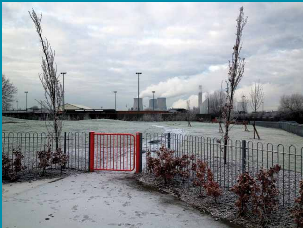
Red Gate Photograph

The work utilises a range of making and participatory practices, including; constructions, in situ painting, artist's books and engaging with buildings users' for research and creative responses to places.