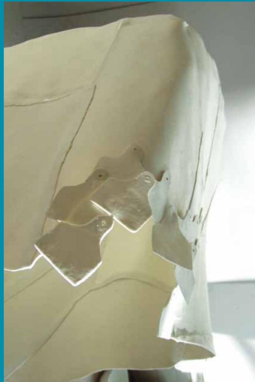
Extermination Tents I (detail) Gas reduction fired porcelain paperclay, electric fired red earthenware paperclay, oxides and screen printed enamel transfers Dimensions variable

Current studio works are ceramic translations of extermination tents used in suburban Durban, South Africa, to rid homes of wood eating pests. These large, skin-like, hollow forms continue a theme of animal related metaphors, albeit in an oblique form. Previous work drew particularly on cattle and cattle related forms. An interest in clay-as-skin as a central metaphor continues to be both a formal and conceptual concern in work that addresses continental, cultural and personal identities.