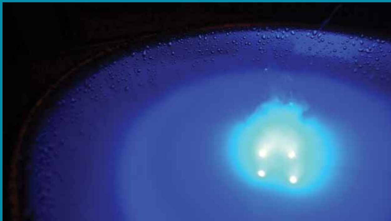
Ἥδωρ (hedor) Experimental light and sound installation (detail)