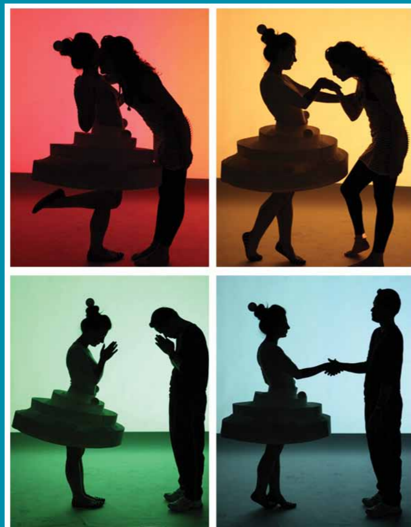
Experimental Greeting space by B. Sert and M.T. Shortt – 2012 Interactive installation with audio and visual projections 2.5 x 3 x 3 m (minimum)

Marie Therese's installation is an interactive space inviting two people at a time to enter and greet each other. Greetings are ritualised forms of acknowledgement but our experience of each greeting is different: the feelings and emotions triggered by an interaction with another person are unique for that moment in time, and the place and space in which it happens. The installation reflects variations in subjective experience, as the mood, sound and overall look and atmosphere of the space change depending on the proximity of the two people greeting.