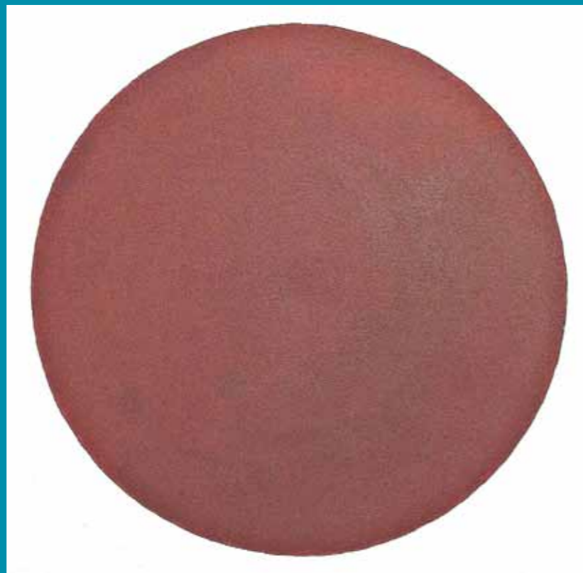
Pearl Square Roundabout 2011 Acrylic, industrial paint, charcoal on canvas 8.2 x 0.5 x 0.0025 m

The viewers and their dialogues with the works are key components in the completion of Mike's works, which are created to question rather than to provide answers.